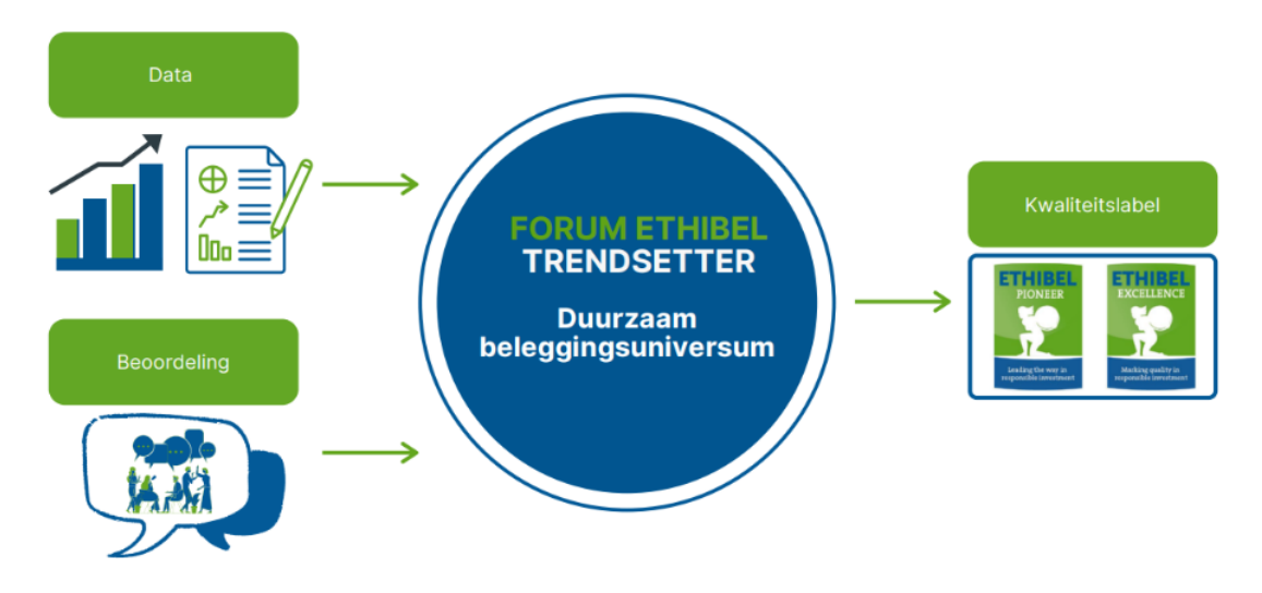
Figure 2 - Overview of pillar 1 Trendsetter