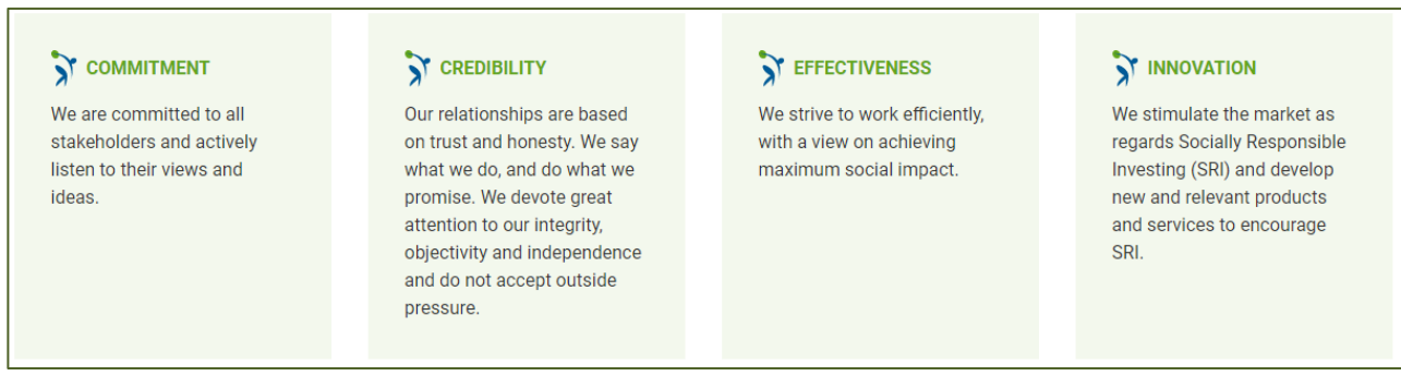
Figure 1 - The four core values of Forum Ethibel

Commitment, Credibility, Effectiveness and Innovation are our core values which we put on the forefront. We believe these values guarantee qualitative work and maximize our positive impact.